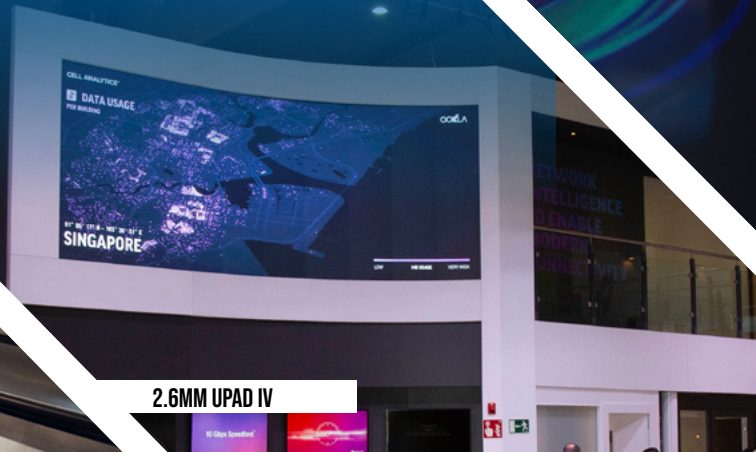
2.6MM UPAD IV