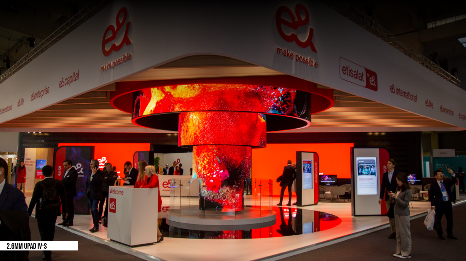
2.6MM UPAD IV-S

If you're looking for a more dramatic curve, our S-Curve panel is for you. Featuring the latest in true smooth curve LED technology, these panels, available in our Upad IV-S product, enable a seamless non-faceted 360-degree curve.