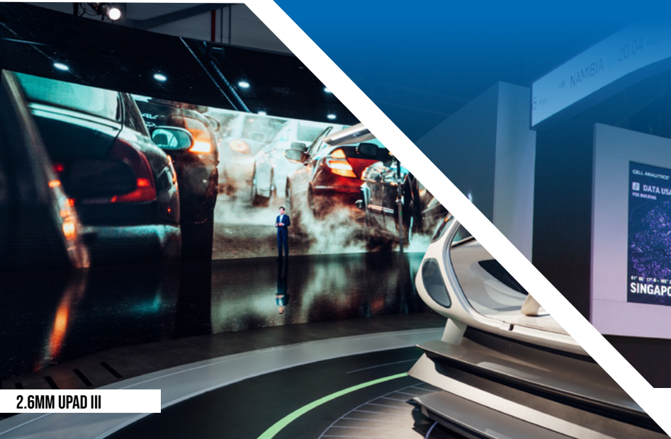
2.6MM UPAD III