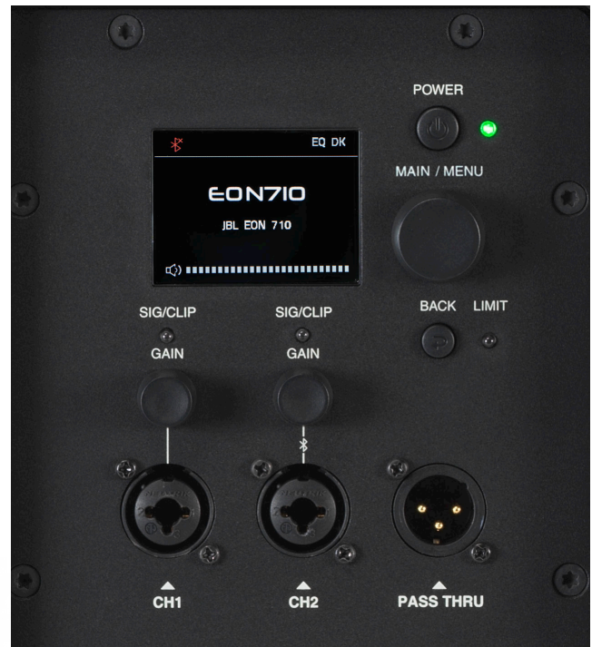
REAR PANEL CONNECTIONS

The JBL EON710 10-inch loudspeaker, part of JBL's new EON700 Series of powered PAs, brings advanced DSP and control to portable systems for live sound and installed applications, with class-leading volume and clarity and comprehensive features that make setup and operation a breeze.