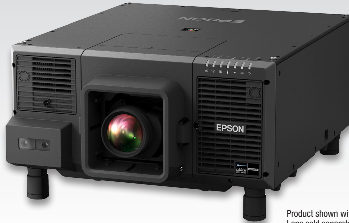
Product shown with lens. Lens sold separately.