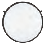
Type 24549 Safety Screen