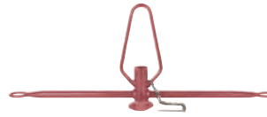
Type 500305 Trapeze