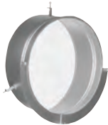
Type 24552 (Type 24515 Diffuser Holder and Type 24549 Safety Screen in one assembly)