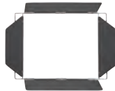
Type 2944 4-Way Light Shield

Globes not included in price of lamp. See price list for complete details.