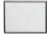
Type 2948S Single Moledura Scrim