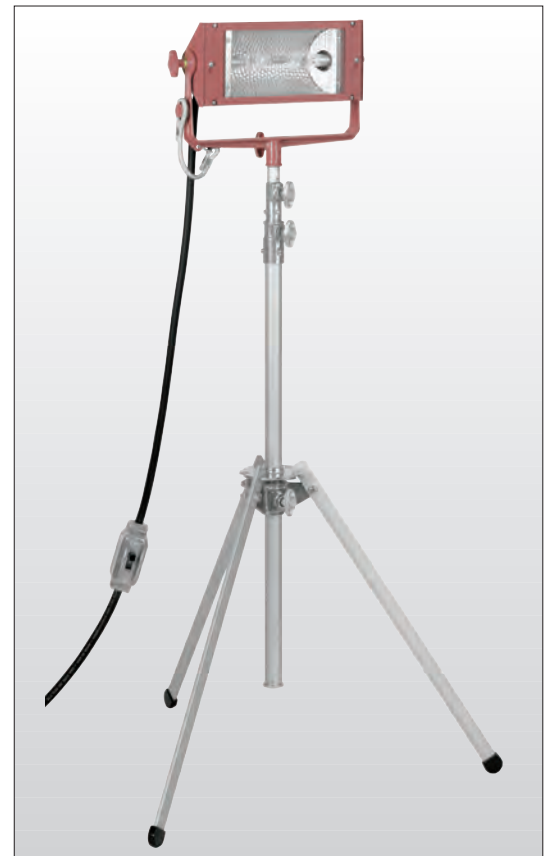
TYPE 2941 MOLEQUARTZ® NOOKLITE MOUNTED ON TYPE 2541 COMPACT LITEWATE BABY SIZE STAND

This versatile lighting fixture is a very portable and compact source of illumination. Its reflector provides a wide, even field of light which makes it ideal for general "fill," background light, or "bounce" light. Equipped with safety screen.