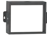
Type 2945 Accessory Holder