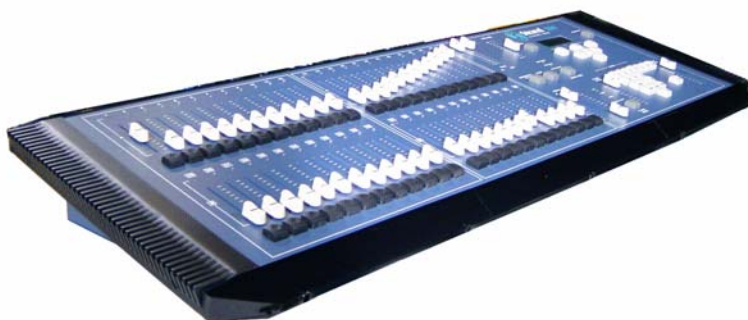
64321 200 Series 24/48 channel console