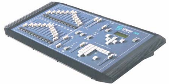
64313 200 Series 12/24 channel console